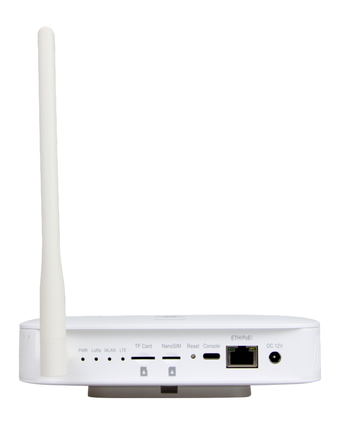
Figure 2: WisGate Edge Lite 2 Interfaces

The hardware interfaces of RAK7268 gateway include DC 12 V, ETH interface, Console interface, Reset key, TF Card slot, Status indicator LEDs, LoRa Antenna connector, etc.